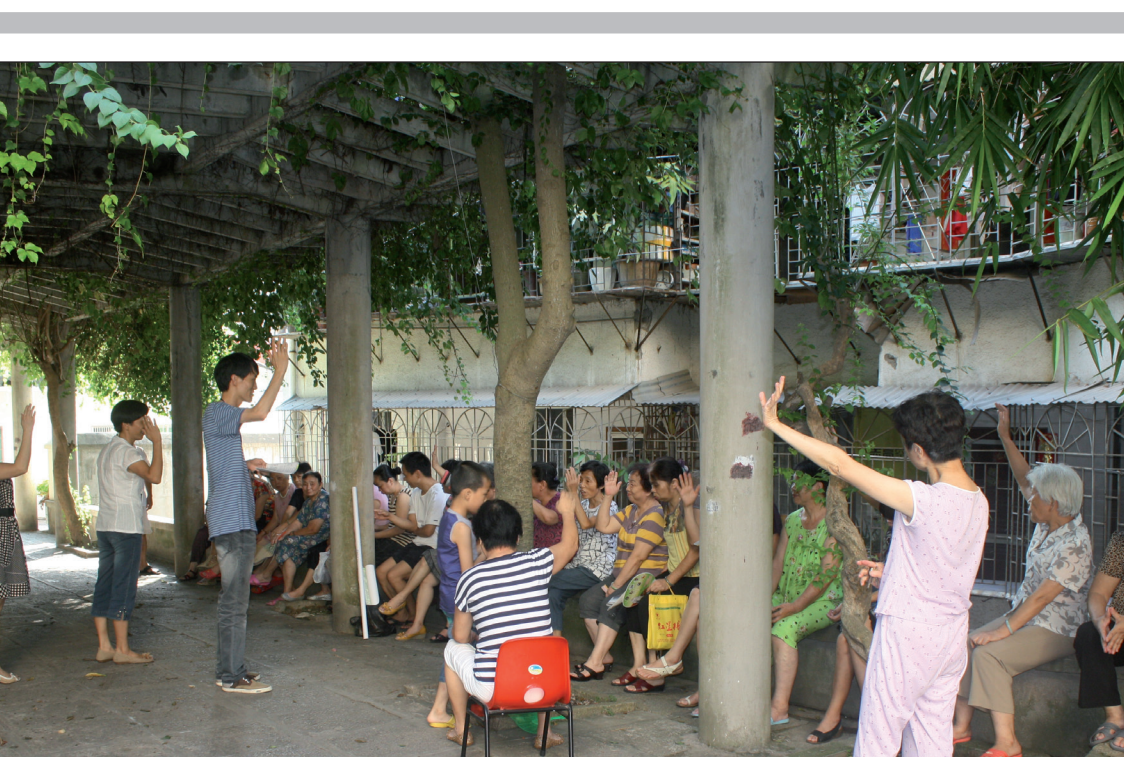
Xiamen is famed for its picturesque setting, investment-friendly climate and close bonds with Taiwan.

Already one of the nation's most advanced cities, it is increasingly wired for a high-quality future, Hu Meidong and Li Fusheng reports.