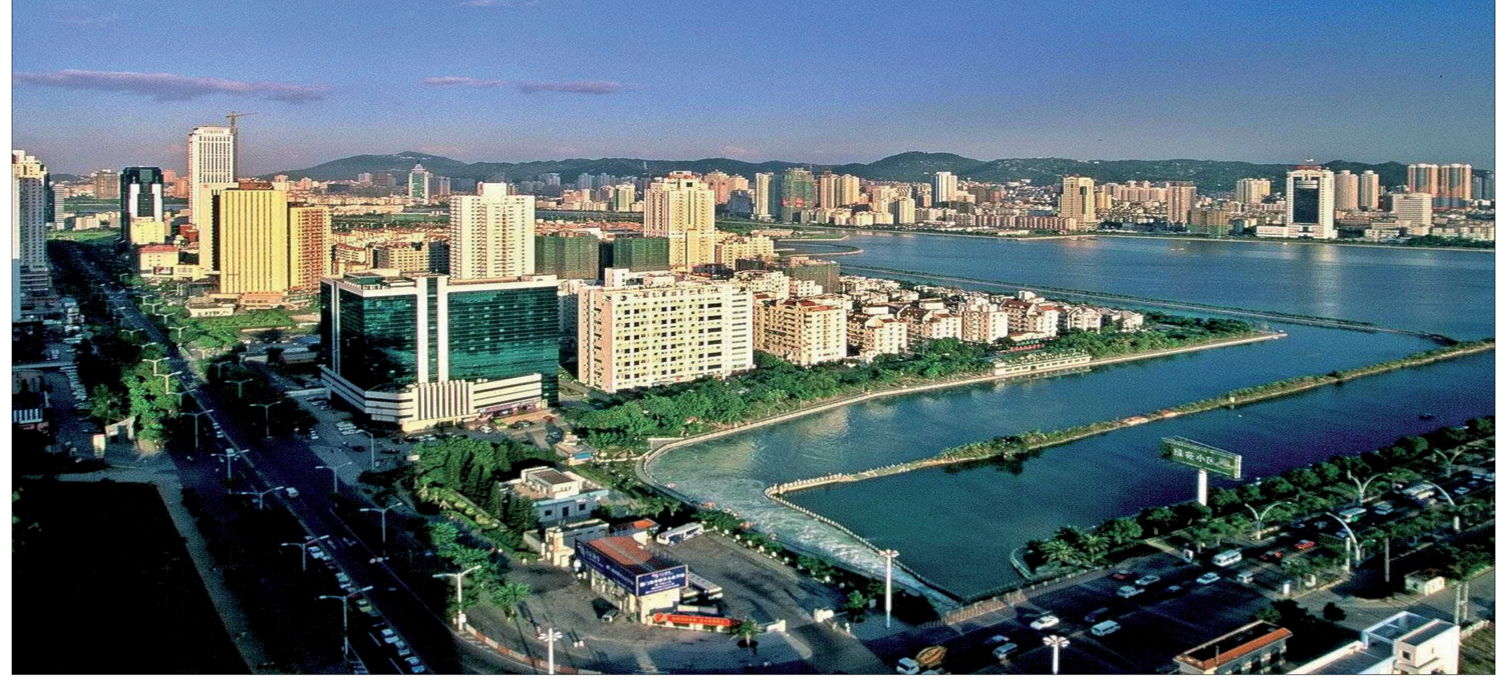
The "Beautiful Xiamen" initiative started last September is designed to create an even more appealing environment for travelers, investors and local residents.