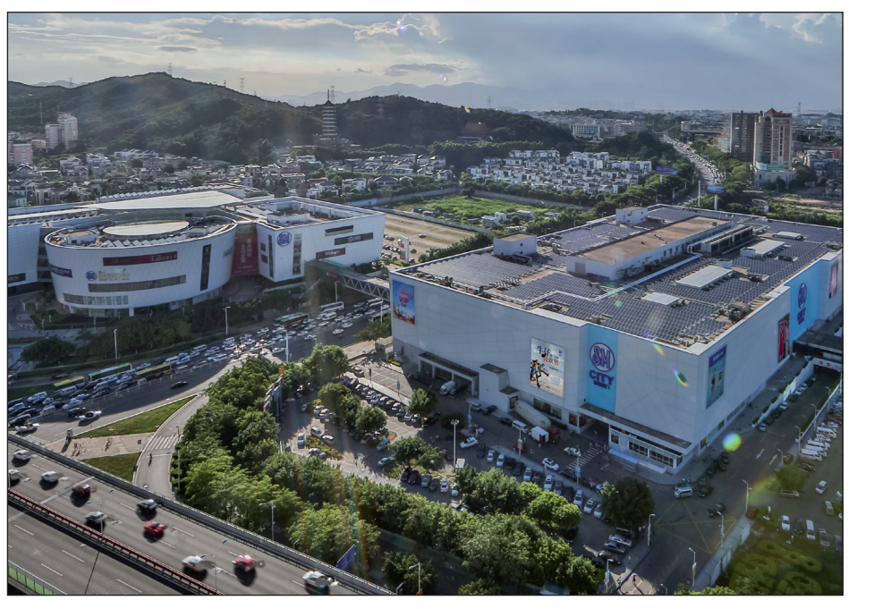
SM Group has rooftop solar panels on its shopping malls in Xiamen

"We are able to save energy and improve efficiency," said