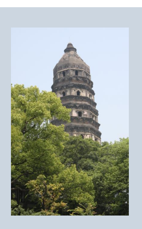
Tiger Hill, the tomb of King He Lu