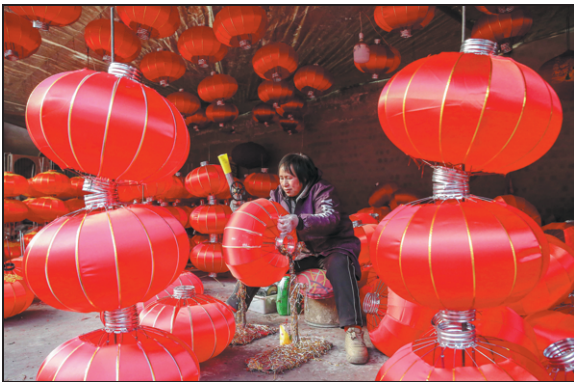
A worker decorates lanterns at a factory in Yangzhao on Dec 30.

nies and professional cooperatives engaged in lantern making, along with three lantern accessory manufacturers. Annually, they produce around 10 million pairs of lanterns — pairs traditionally symbolizing good fortune — with a total output