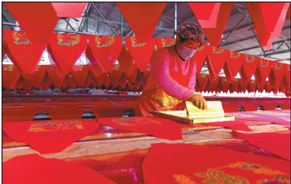
A worker prints patterns on lantern covers at a workshop on Jan 11.

processing factory. “To welcome the Year of the Snake, orders have significantly increased since October, and workers have been busier. I have been answering order calls and managing deliveries all the time.”