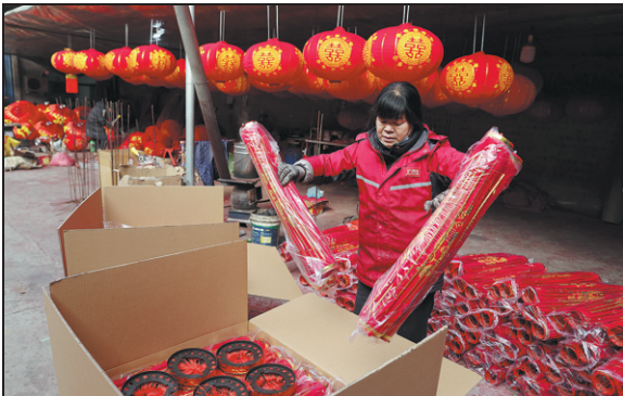
A worker packages lanterns in the village on Jan 11.

value of 150 million yuan ($20.5 million). Lanterns provide employment for over 2,000 people in the village and surrounding areas.