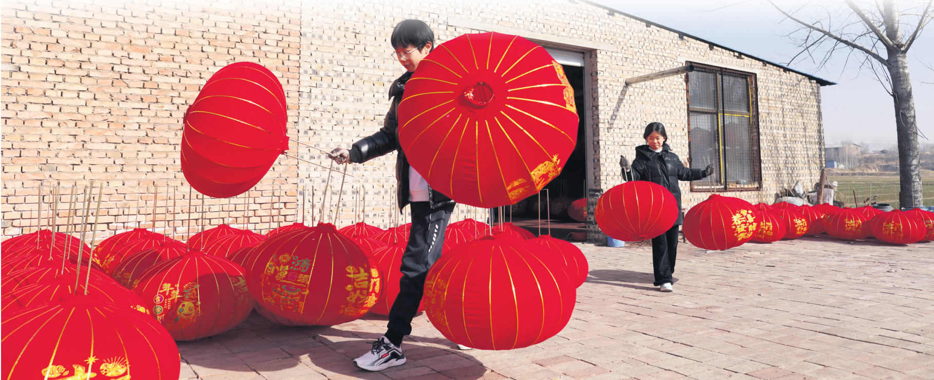
Workers place semifinished lanterns for drying on Jan 11.

Contact the writers at zhuxingxin@chinadaily.com.cn