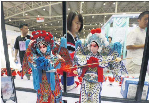
Local culture: Peking Opera dolls on display on Aug 28 during the four-day Beijing International Cultural and Creative Products Trade exhibition in Beijing.