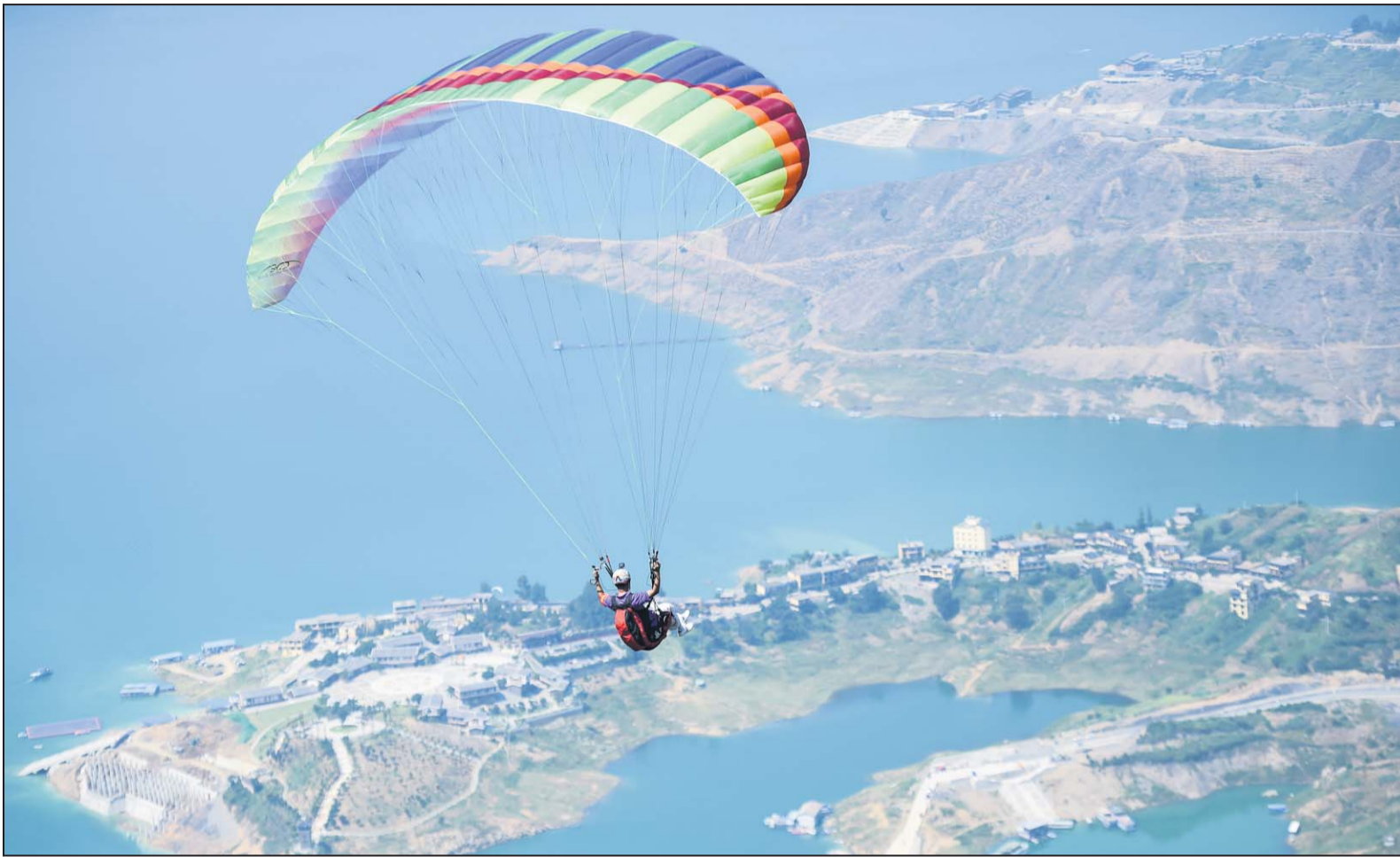
High-flier: A paraglider competes at an international paragliding tournament in Liupanshui, Guizhou province, on Aug 27. The event attracted more than 70 contestants from 20 countries and regions.