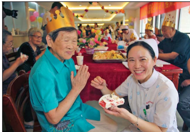
Big day: A birthday party on Aug 28 for 22 old people at a nursing home in Huaibei, Anhui province.