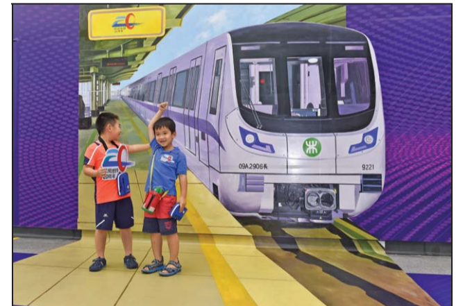
Track of time: Boys pose for photos in front of a 3D-painting of a subway train during an exhibition in Shenzhen, Guangdong province, on Aug 27, as the local subway company celebrates its 20th anniversary.