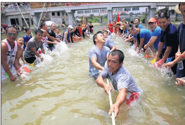
Pulling together: Villagers in Liaohe village of Rongshui Miao autonomous county in Liuzhou, Guangxi Zhuang autonomous region, participate in a tug-of-wa(ter) on Aug 25 as part of the celebrations of Ghost Festival, or Zhongyuan Festival, which falls on the 15th day of the seventh lunar month each year, to remember and honor ancestors.