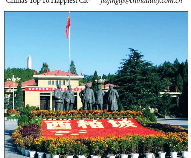
Xibaipo Memorial marks the site of the Communist Party of China's last rural headquarters before it moved into Beijing and liberated the entire country. It is now a national base for patriotic education.

Contact the writers at liuxiang@chinadaily.com.cn and jiajingqi@chinadaily.com.cn