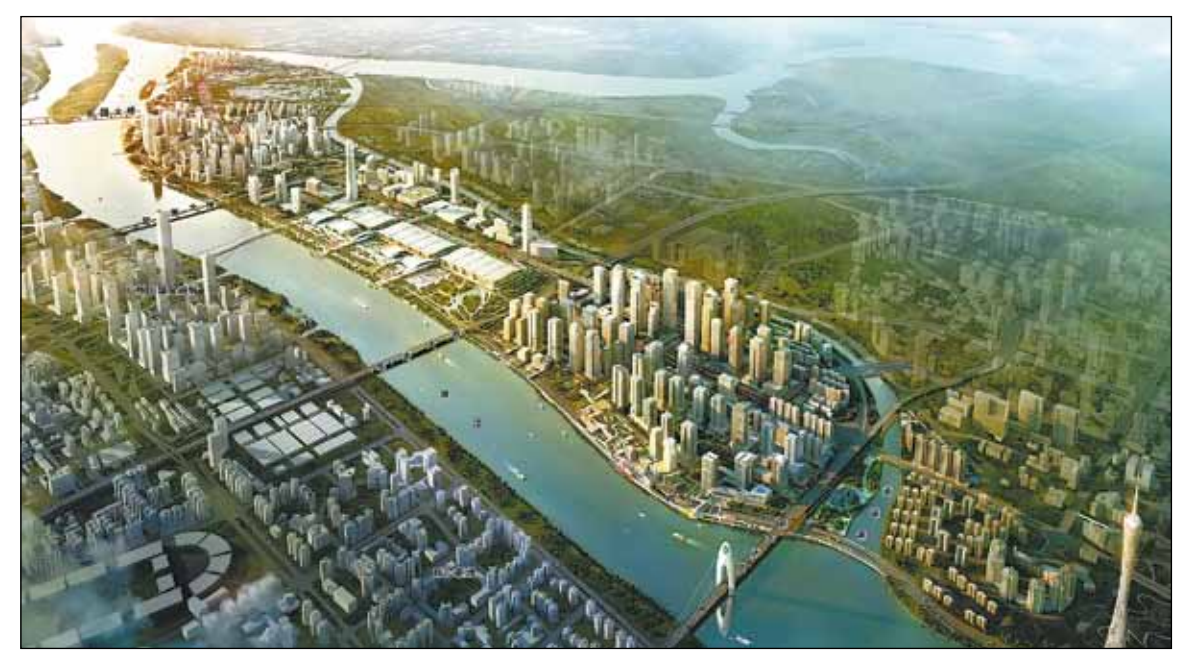
The Pazhou area in Haizhu is rising as a modern hub for traditional commerce and e-commerce as it is home to the Pazhou Complex of the Canton Fair and the planned Pazhou Internet Innovation Zone.

The city also ranks second in the indices of China's e-commerce application and development in 2014, said a report released by Alib-