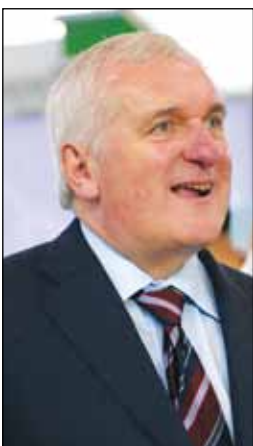
Former Premier of Ireland Bertie Aher joined the event in 2011.