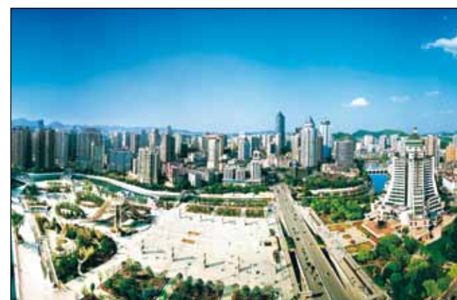
Zhucheng Square, built on the bank of the Nanming River, is a landmark of Guiyang.