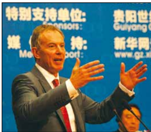
Former UK Prime Minister Tony Blair addressed the Eco-Forum Global on Aug 22, 2009.