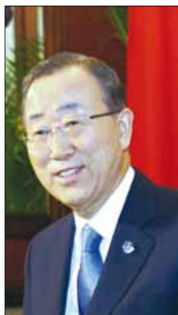
On the opening ceremony of 2011 EFG, UN Secretary-General Ban Ki-moon sent a congratulatory letter to the event.