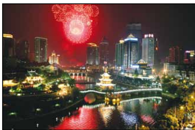
Jiaxiu Pavilion, perched on a boulder in the Nanming River in the south of Guiyang, was built in 1598.

Contact the writers at yangjun@chinadaily.com.cn, sujiangyuan@chinadaily.com.cn and zhaokai@chinadaily.com.cn