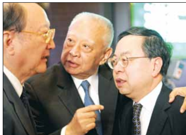
Tung Chee Hwa (center), the first elected chief executive of Hong Kong special administrative region, took part in the event last year.

Contact the writers at yangjun@chinadaily.com.cn and zhaokai@chinadaily.com.cn