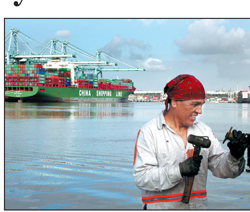
A man works on the dock as China Shipping containers are unloaded from a ship after being imported to the US.