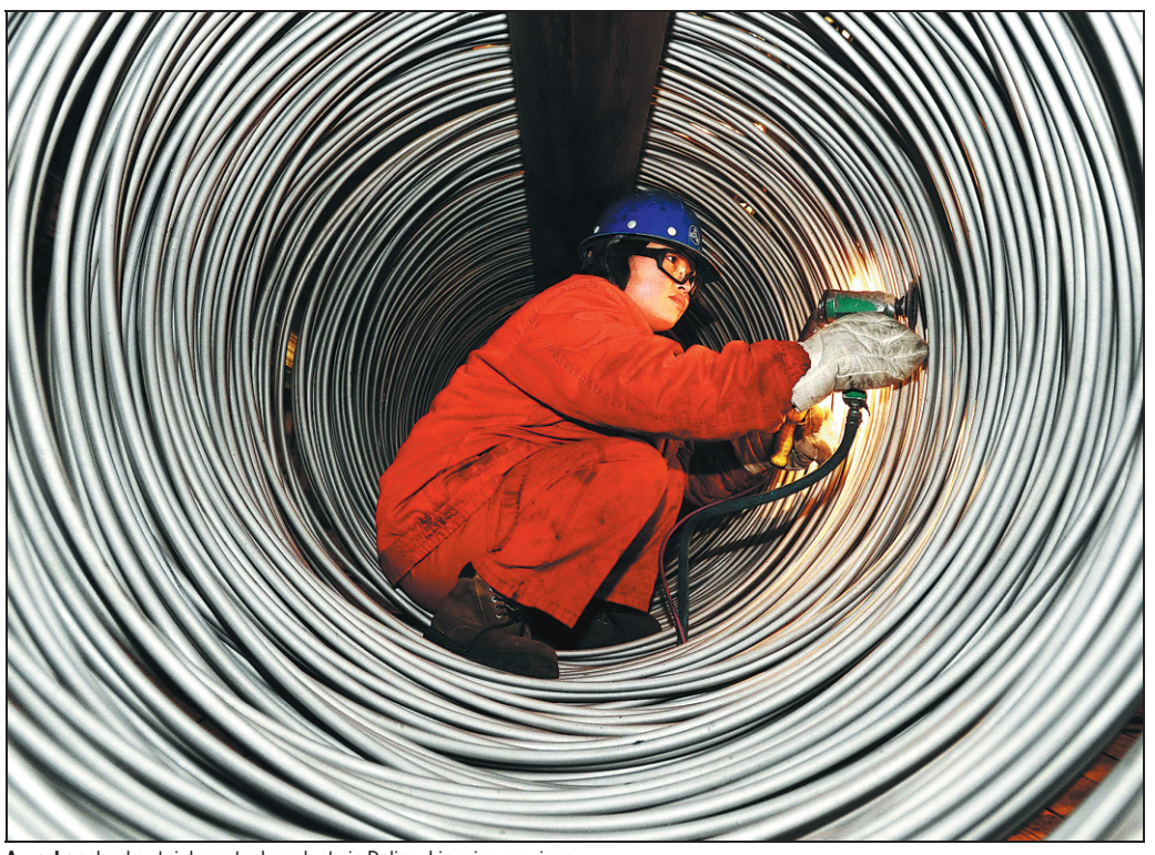
A worker checks stainless steel products in Dalian, Liaoning province.