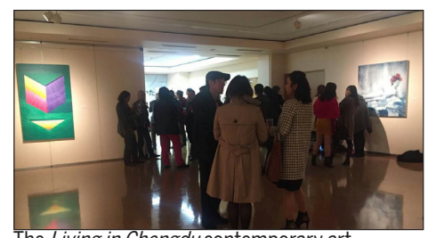
The Living in Chengdu contemporary art exhibition was held at the Nitten Exhibition Hall in Tokyo from Dec 17 to Dec 23.

Artist Zhou Chunya said: "Only when a city has its culture and substance can it attract tourists. The Landing art zone in Chengdu now accommodates hundreds of artists operating their studios and workshops, organizes art shows and has evolved into a famous modern