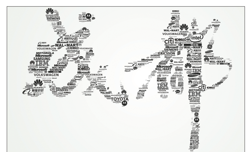
The characters for "Chengdu" made up of the logos of multinational companies. The city is home to

Local officials said that the modern industries and leisure business in the new area will help create an "industrialized