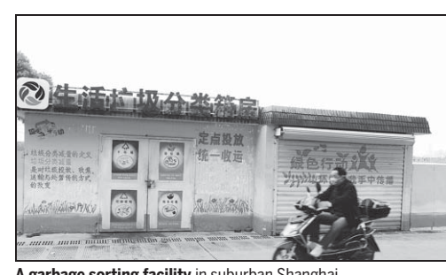
A garbage sorting facility in suburban Shanghai

According to the draft, any individual or working unit will be held responsible for the proper sorting and disposal of garbage they produce. Those who fail to follow the rules can be fined up to 200 yuan ($29) if the offender