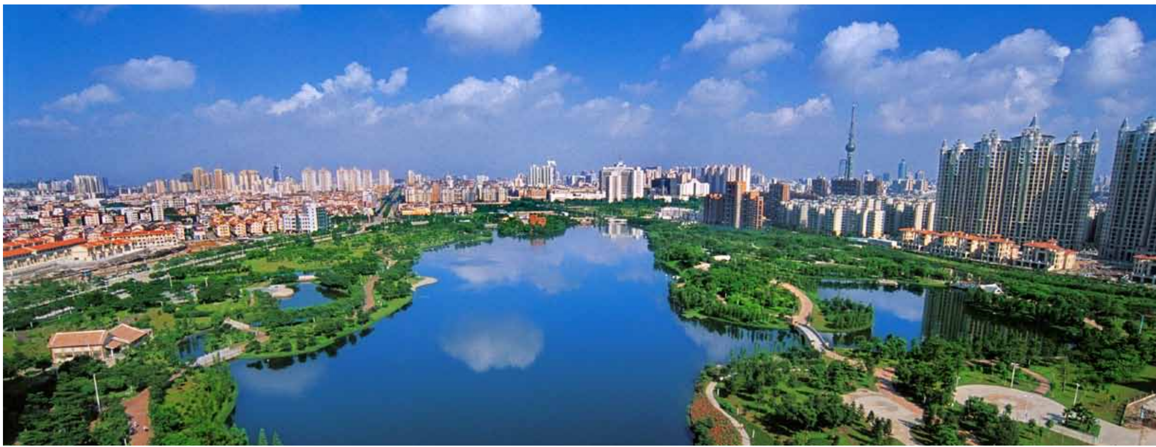
A traditional manufacturing hub in South China, Foshan expects to play a big role in the 21st Century Maritime Silk Road initiative.