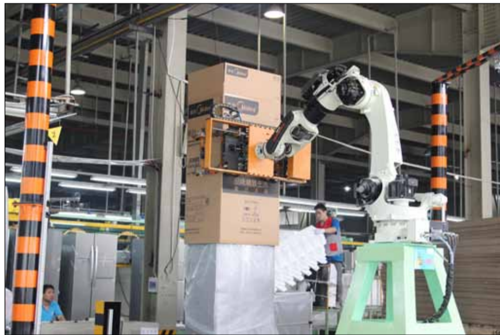
Automated production at a packaging plant of Midea Group.

"We encourage local manufacturers to innovate their production and operation modes so our manufacturing becomes