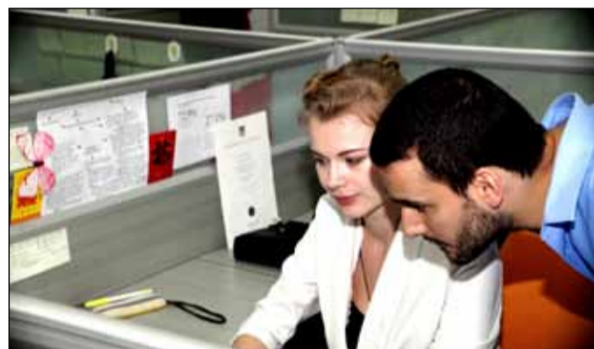
The Foshan Bureau of Commerce is the first government department in China to hire foreign professionals.

Analysts said that today's Foshan has many aces to play