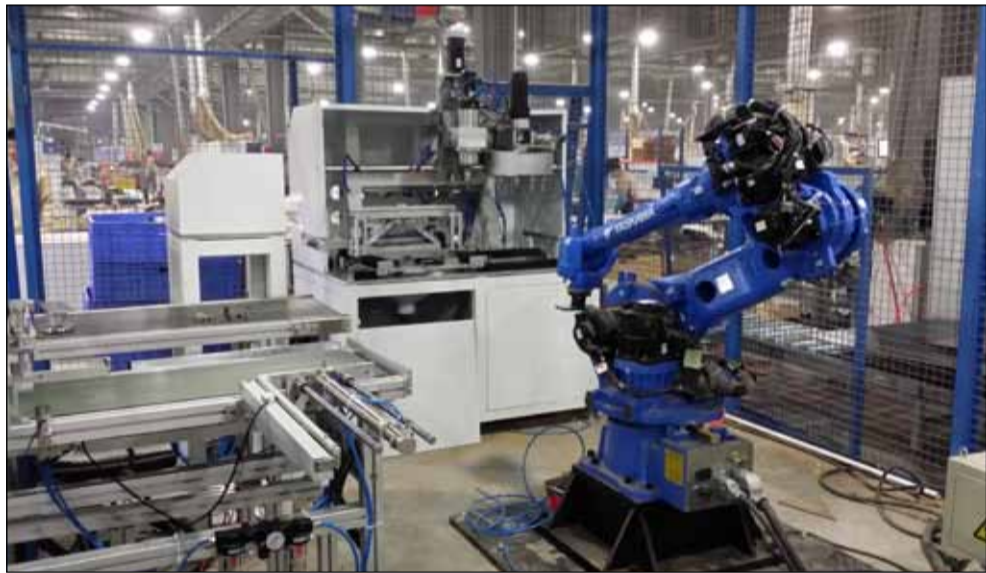
Robots are used by Wision Co for the manufacturing of furniture.