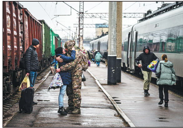
A Ukrainian serviceman embraces his wife as she arrives from Kyiv at the train station in Kramatorsk on Sunday.

Germany has approved 2.6 billion euros ($2.75 billion) worth of arms to Ukraine in the past year, trailing the