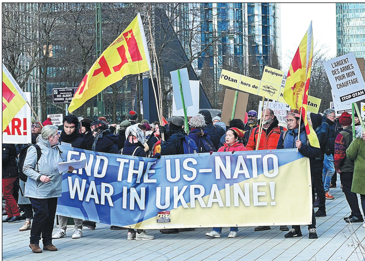
Protesters in Brussels on Sunday vent their views in a demonstration calling for an end to the conflict in Ukraine.