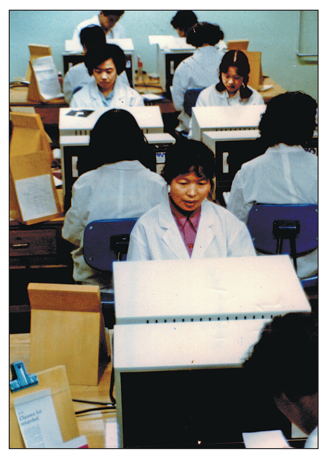
Left: China Daily staff members celebrate the first anniversary of the newspaper on June 1, 1982, in the first group picture of the newspaper's employees. Right: Reporters' edited stories are input into computers in 1980 during preparations for the newspaper's launch in 1981.