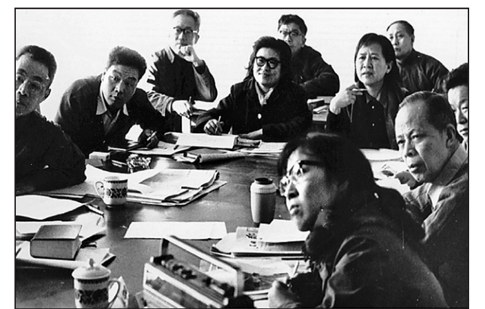
Top left: Staff members learn to lay out pages in the 1980s. Above left: Editors supervise pages being sent to printing plants in Europe by satellite for the first time in 1985. Center: Journalists pose for a photograph outside the newspaper's former office on the East Third Ring Road in Beijing. Top right: China Daily organizes a world news photo exhibition in 1985. Above right: Editors attend a meeting in the 1980s.