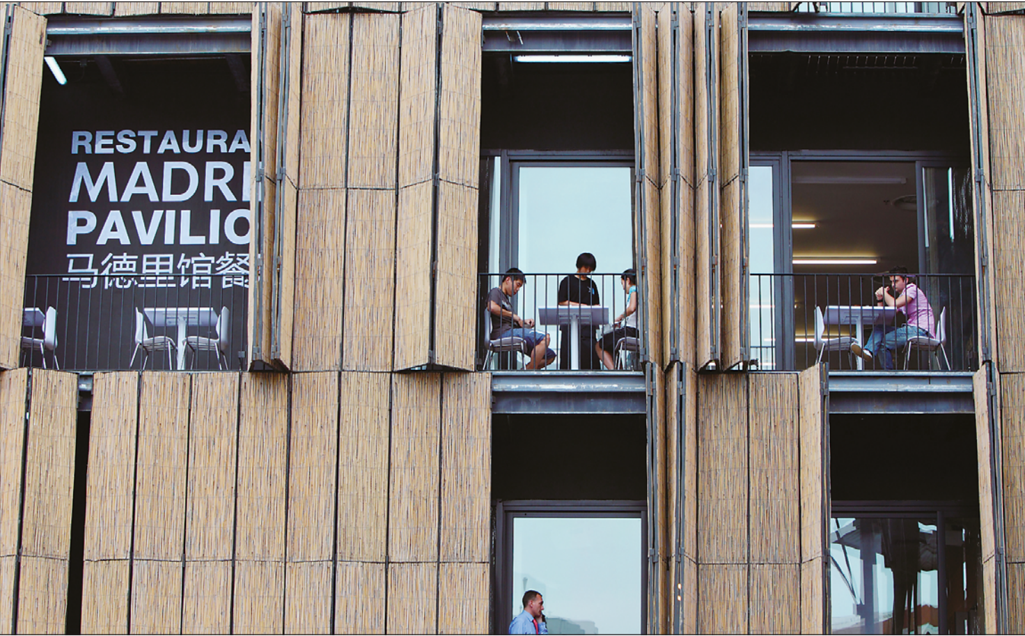
Visitors inside the Madrid Pavilion's bamboo housing.

Similar plans are underway to redevelop Shanghai's Lingang New City, near Pudong Airport, and Huangpu district, one of the oldest parts of the city, she said. Huangpu also houses the UPBA,