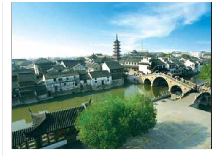
Qiandeng, an ancient water town in Kunshan, Jiangsu province