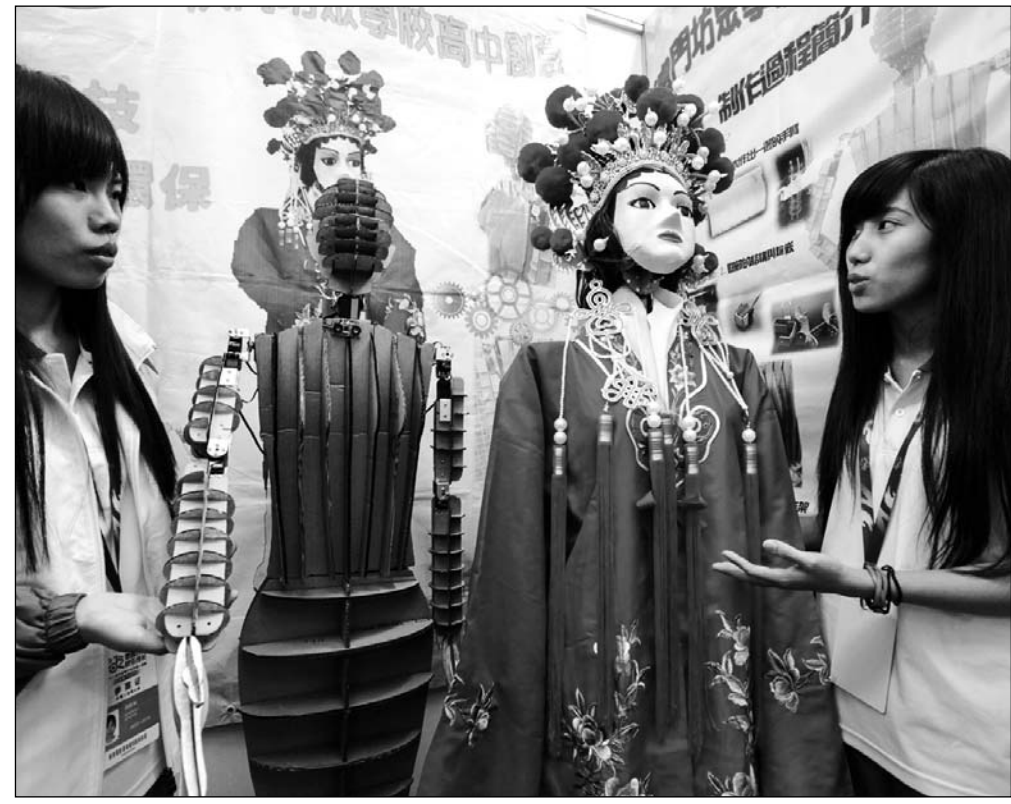
Two youngsters from Macao show off their robot, Cantonese opera ambassador, at the 12th Chinese teenagers' robot competition, in Tianjin on July 18. The robot was made of "green" materials. The competition attracted more than 500 entries.