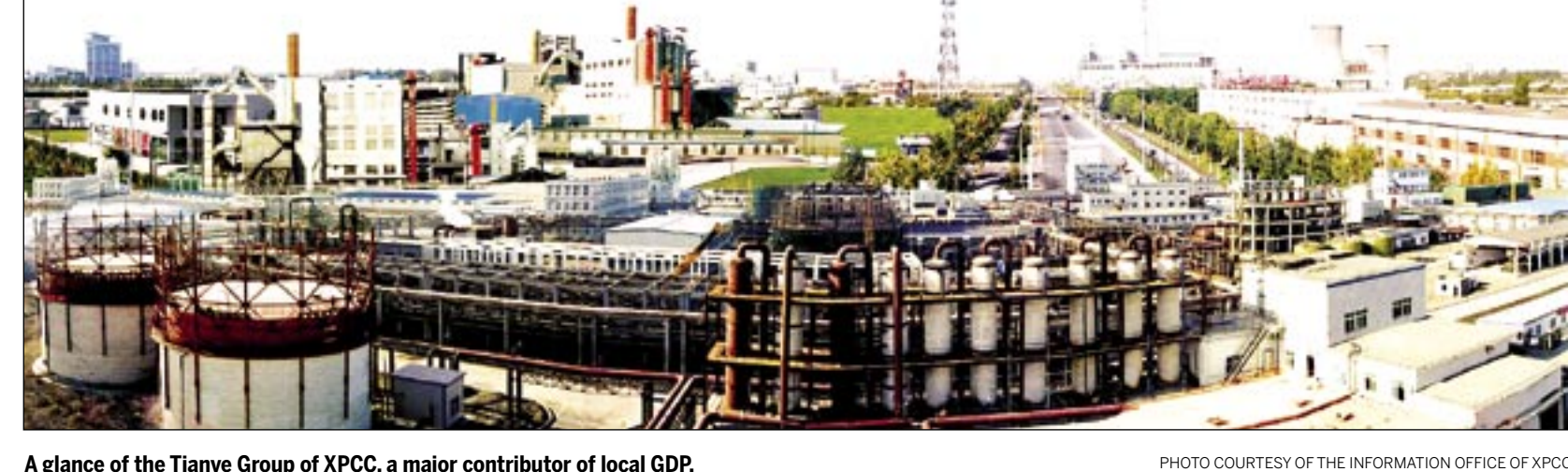
A glance of the Tianye Group of XPCC, a major contributor of local GDP.

XPCC was able to use policies that supported agriculture and benefited farmers, so that farmers got 210 million yuan in subsidies in all