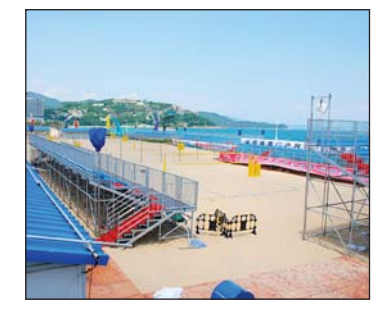
Fountain in Sungang Road 笋岗路喷泉

The pictures above present a natural and clear beach volleyball stadium against the sea vista. The Yantian Sports Complex, located in the Dameisha area of Yantian district, is a main stadium for volleyball matches during the Universiade Games. However, it has not been solely designed for volleyball. After the Games, the Complex Center can host other sports like basketball. Come to have a look and check out this main attraction.