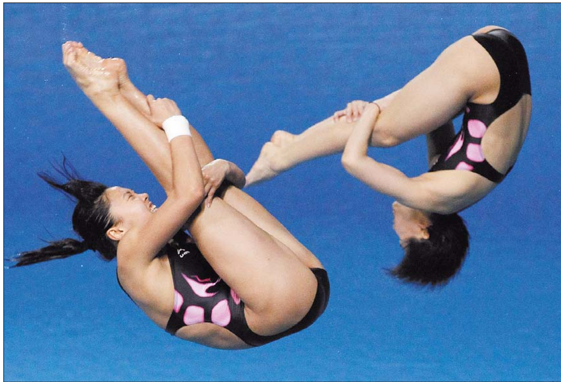
China's Shi Tingmao (top) and Wang Han compete in the women's synchronized 3m springboard final on Monday. China won the gold medal.

In the men's synchronized 10m platform, China's Yang Liguang and Zhou Luxin won gold, followed by Malaysia's Bryan Nickson Lomas and Ooi Tze Liang.