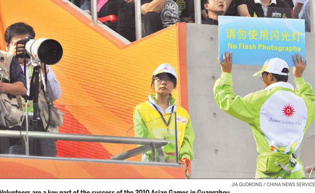
Volunteers are a key part of the success of the 2010 Asian Games in Guangzhou.

point" program to evaluate the performance of the volunteers, based on the time and efficiency of their work.