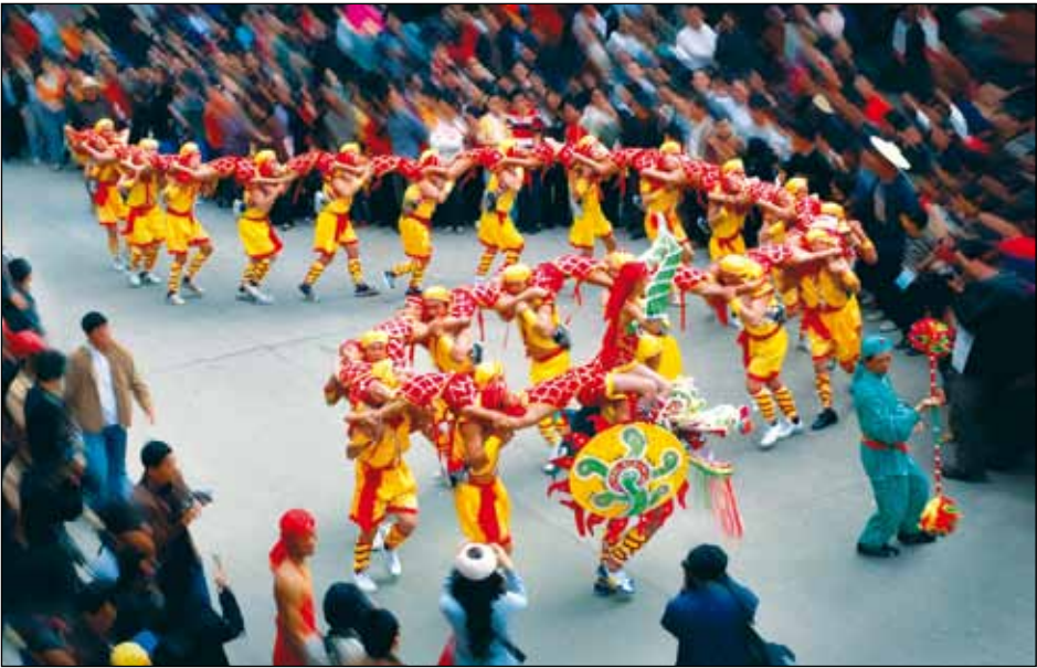
Men dragon dancing is a traditional folk art performed on special occasions in the city.

As the host of the 14th provincial sports competition in 2014, the city is getting a face-lift and turning the Haidong New District into a landmark area, Wang said.