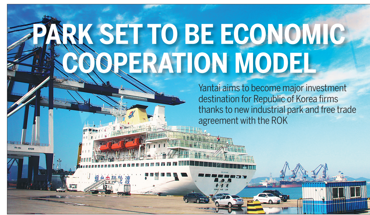
The Yantai China-Republic of Korea ferry vows to boost its services from Yantai to the ROK.

Yantai's pillar industries, such as machinery manufacturing, electronic information and food processing, as well as emerging industries including equipment manufacturing, energysaving and environment protection, creativity and animation design are in tune with the ROK's industrial struc-