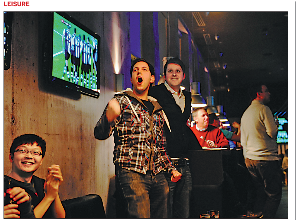
Fans cheer their team in a pub in Newcastle, the United Kingdom. LeTV Holdings Co Ltd has won the rights to broadcast the English Premier League for the coming three seasons in Hong Kong.

"Even though many industries suffer heavy losses caused