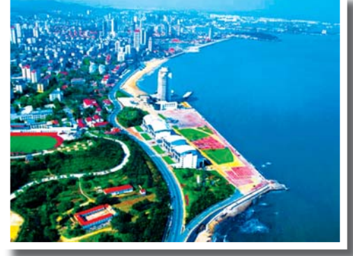
A bird's eye view of the coastal city's seaside tourism resort.

Since 2007, an International Wine Festival has been held annually in Yantai, providing a further boost to both the local tourist industry and the