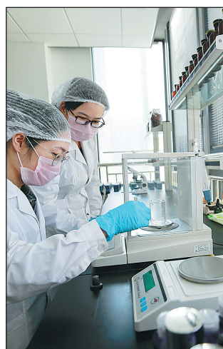
Technicians weigh ingredients to be used at Weifang Na'ao Cosmetics.

In the first seven months of 2018, companies in the Weifang Hi-tech Industrial Development Zone submitted