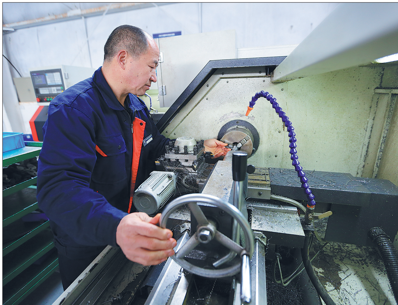
Weifang Litro Electrical Technology , which is based in the Weifang Hi-tech Industrial Development Zone, is known as a leading Chinese manufacturer of multipoint fuel injection systems.

"Many things were better for us than for foreign products. For instance, our costs were only one-fifth that of imported products. However, we encountered problems in promoting our