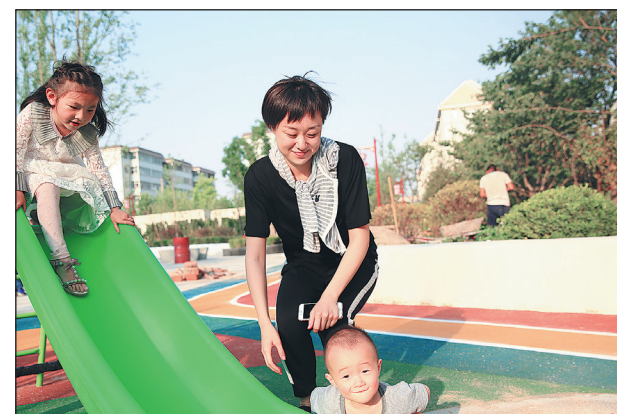
Residents play with their children at one of the "pocket parks" built in the Weifang Hi-tech Industrial Development Zone.