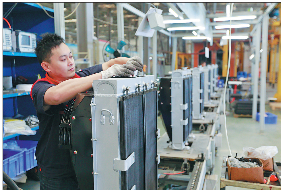
An employee works on a radiator assembly line at Shandong Yinlun Heat Exchange System, a high-tech company in the zone.

This year, the zone has undertaken a series of measures to support high-growth businesses. It estab-