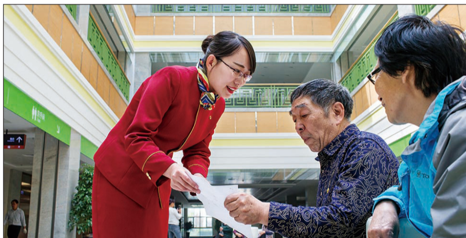
An employee from Sunshine Union Hospital in Weifang Hi-tech Industrial Development Zone provides services for patients.