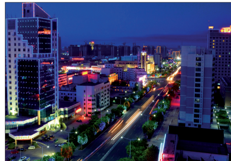
A nighttime view of a residential area in the Weifang Hi-Tech Industrial Development Zone.