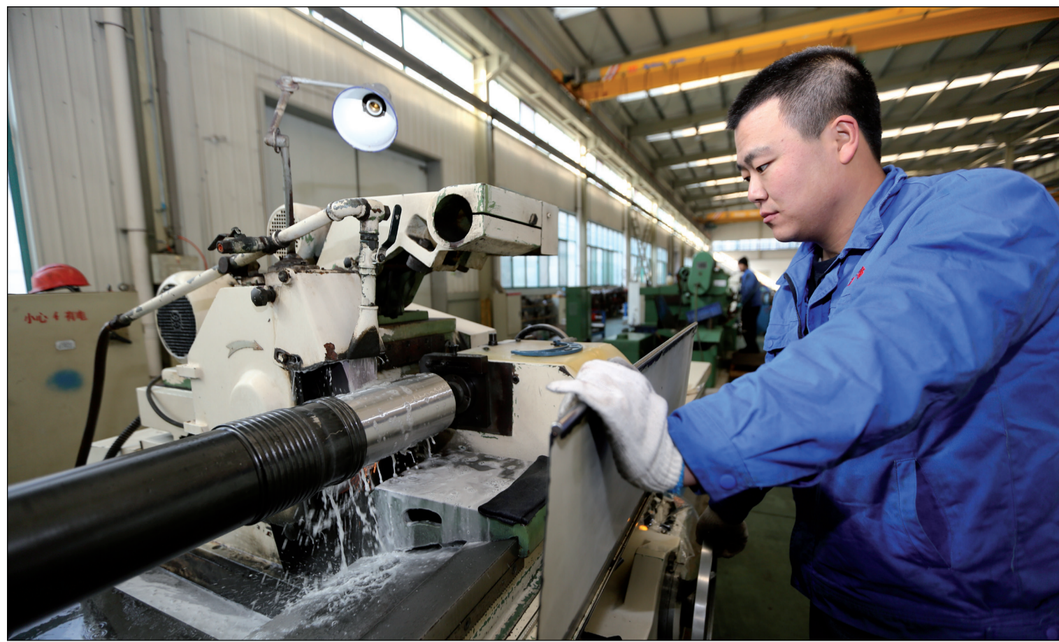
A technician works on the production line at Shandong Tianrui Heavy Industry.