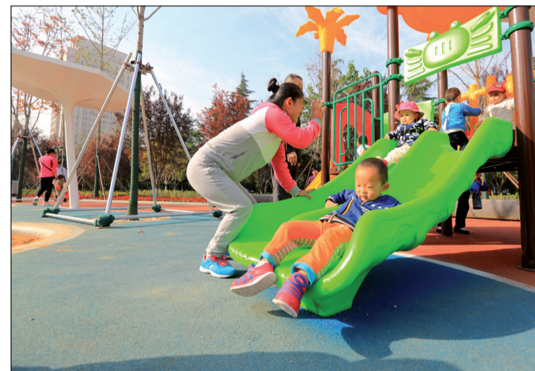
Residents play with their children at one of the pocket-size parks built in the zone.