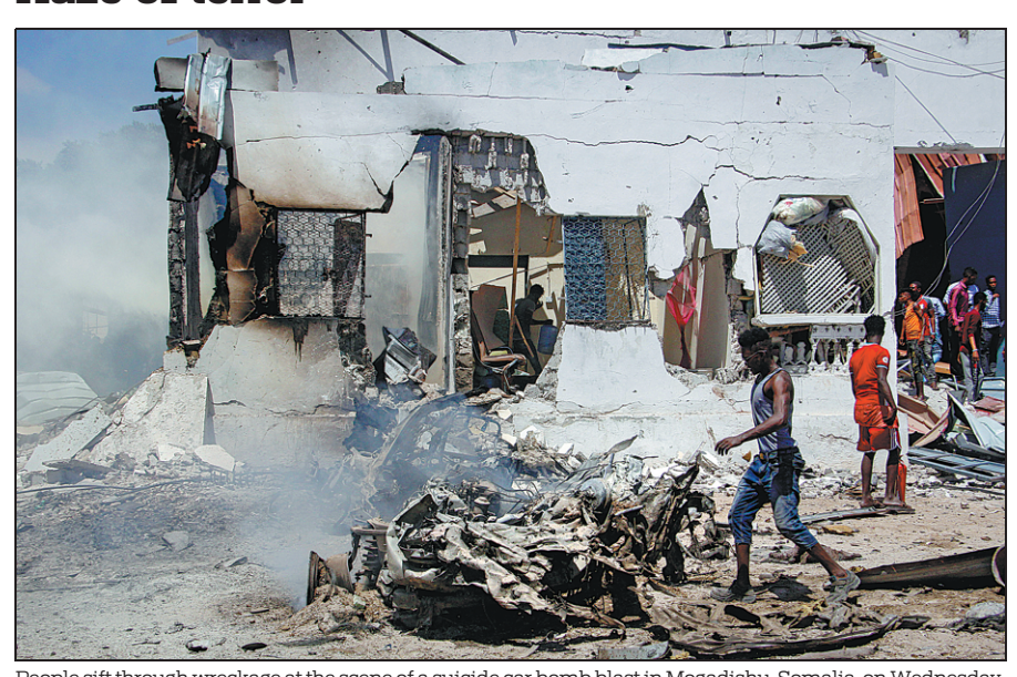
People sift through wreckage at the scene of a suicide car bomb blast in Mogadishu, Somalia, on Wednesday At least 10 people including five soldiers were killed. The attack was claimed by the al-Shabaab extremist group, which said it was targeting "foreign officers".