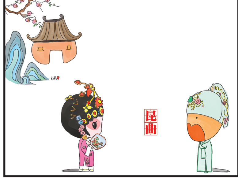
The local Kunqu Opera is representative of Chinese opera with its elegant style. ILLUSTRATION BY JIA RU