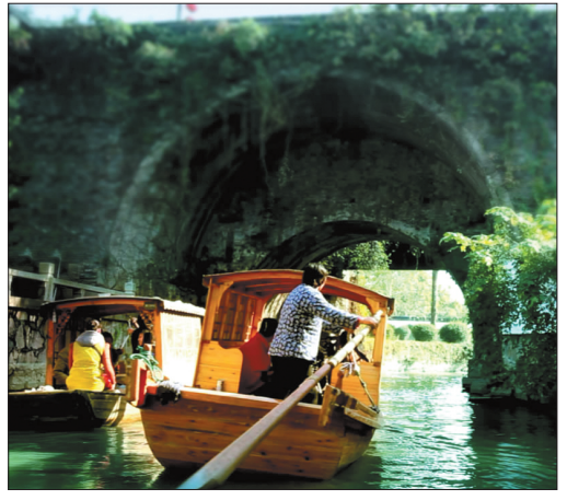
Many tourists to Suzhou line up for a boat trip on one of the many streams in the ancient city. PROVIDED TO CHINA DAILY

Picking fresh fruit such as plums in the suburbs of Suzhou is a new experience for many visitors to the city. PROVIDED TO CHINA DAILY