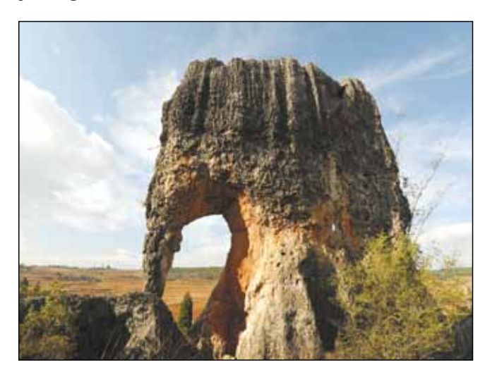
The rocks in the stone forest were formed about 270 million years ago.

"Elephant Rock" is among the variety of shapes.