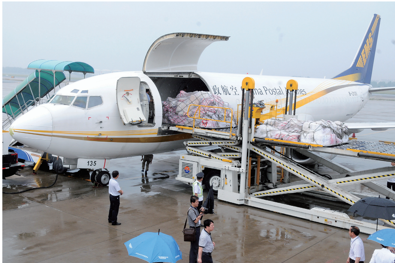
China's postal sector deals with 990 million pieces of express mails and parcels in the first two months of this year.

DHL will bankroll new strategies to retain and grow its market share from the China-Europe trade by railway. Its Global Forwarding formed a new partnership with a preparatory committee of the United Trans-