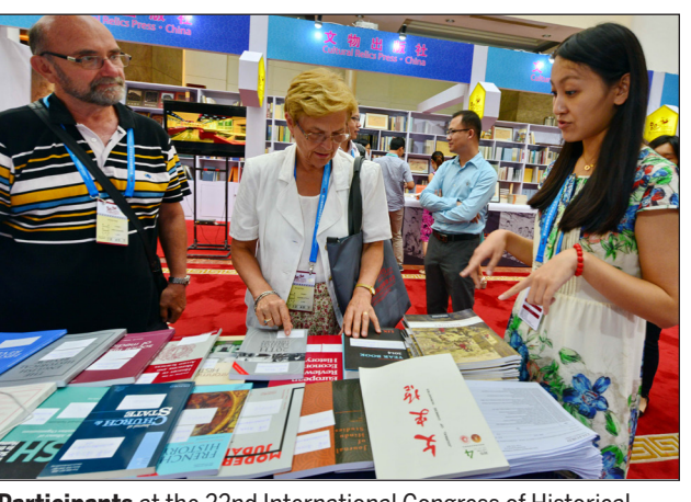
Participants at the 22nd International Congress of Historical Sciences look at publications including the Journal of Literature, History and Philosophy.

journal is a respected publication from Shandong University that has presented many influential discussions on Chinese culture and history, such as discussions on A Dream of Red Mansions , one of China's four great classic novels.