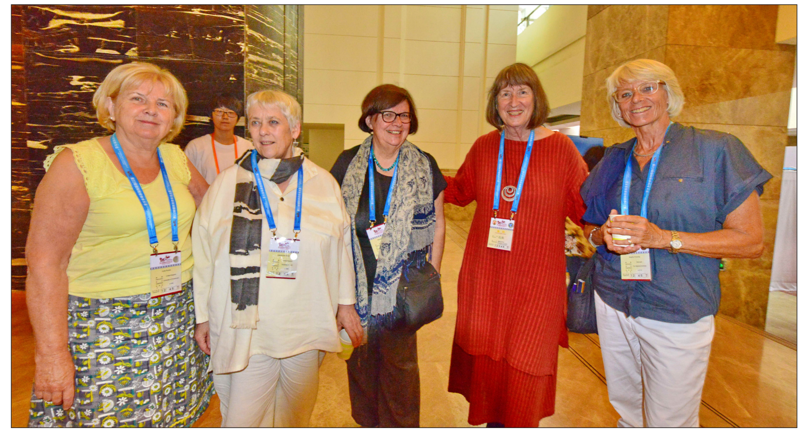
Female historians from around the world talk between meetings at the 22nd International Congress of Historical Sciences.