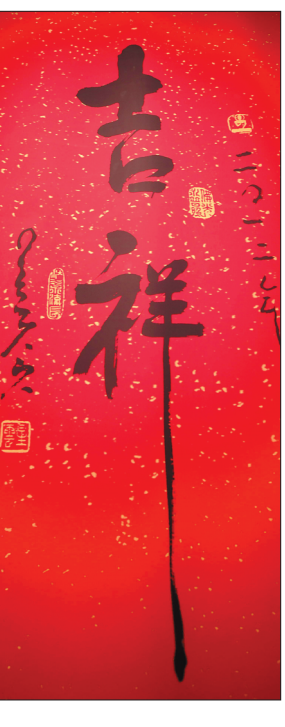
Hsing Yun's calligraphy says "auspiciousness".