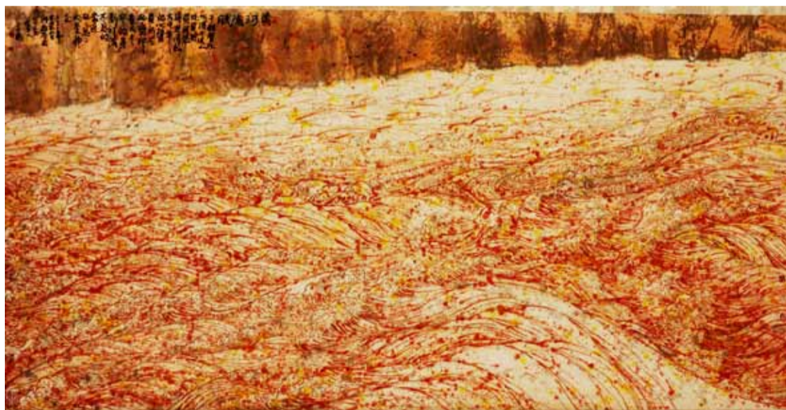
Yellow River Waves