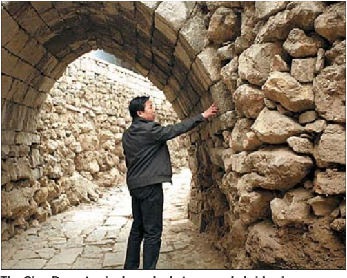
The Qing Dynasty single-arched stone-made bridge is composed of two levels of roads, one on top of the other.