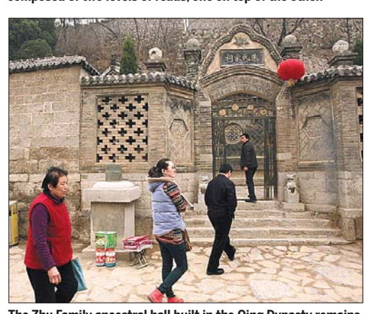
The Zhu Family ancestral hall built in the Qing Dynasty remains in good condition.

Zhujiayu Village is located in the county-level city of Zhangqiu, about 45 km to the east of Jinan, capital of Shandong province.