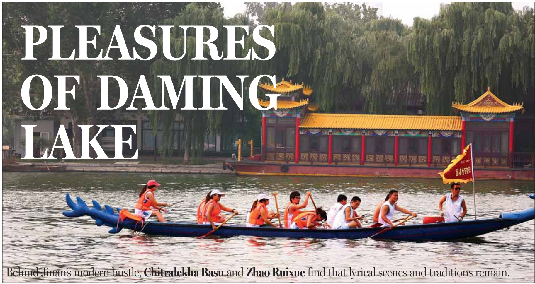
The annual boat race held at Daming Lake, a water mass created by the convergence of hundreds of springs.

city is still the focal area if you're looking for some of Jinan's most iconic landscapes – where the city's elderly and the very young like to gather. It's a retreat for those who want to renew their bonds with nature, even as life speeds past them in one of China's fastest-