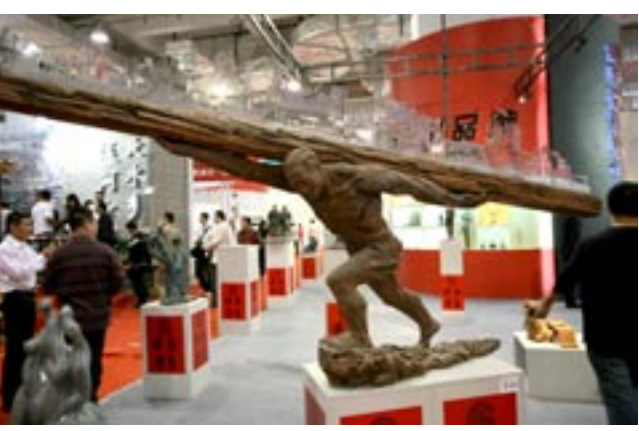
Sculpture displayed at the expo

dong", Cultural Tourism Hall highlights local scenic sites, tourism products, festivals and artistic performances.