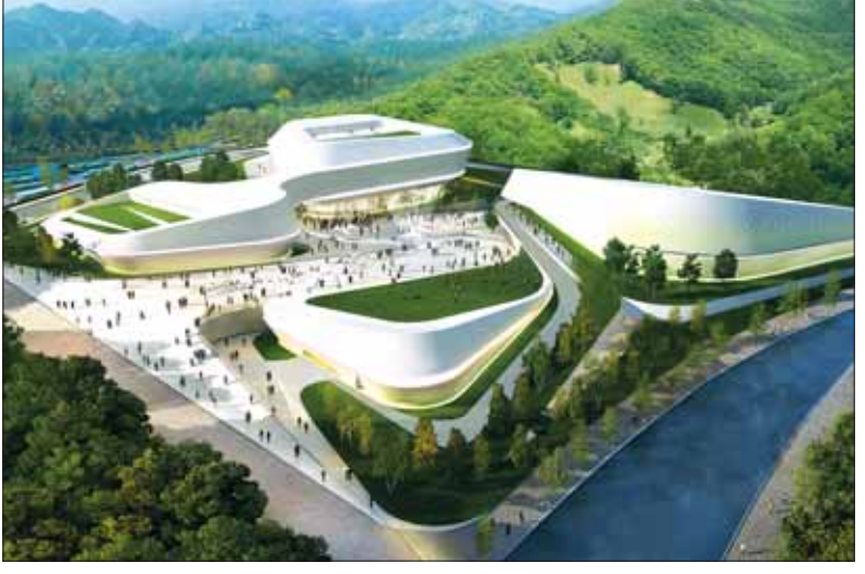
A rendition of the Theme Pavilion, one of the two landmark buildings of the 2014 Qingdao International Horticultural Exposition. Its design inspired by the China rose, the pavilion resembles