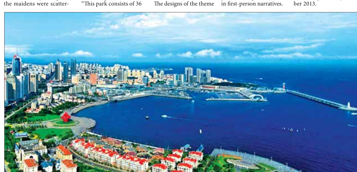
Qingdao, one of China's most beautiful coastal cities, is a major seaport and economic center in China.

So far, the main roads have been paved and pipelines have almost been put in place. The main construction projects are expected to be completed by the end of this year. The necessary trees have been acquired and are scheduled to go into place by winter. All the work will be accomplished by Octo