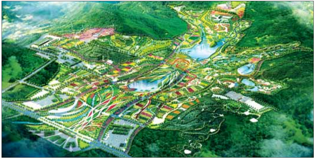
Artist's conceptualization of an aerial view of the proposed layout for the 2014 Qingdao International Horticultural Expo.