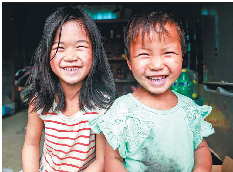
Two children show off their smiles for the volunteer photographers.