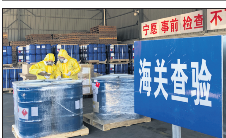
Customs officials check smart security locks. Officials examine goods.

during the on-site inspection and quarantine.