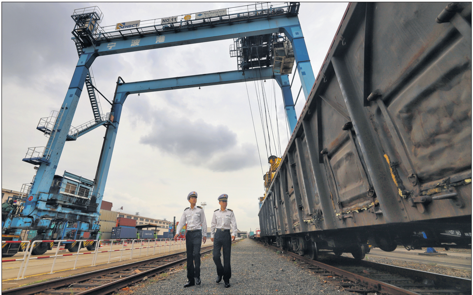
Customs officials of Ningbo Customs in Zhejiang province inspect a rail-sea combined transportation site.

This technology means that processing at the port can be carried out