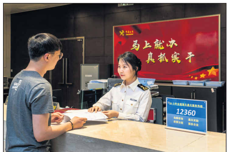
Ningbo Customs provides consultancy services for a company representative.

Ningbo Customs is also providing support for the rapid development of export enterprises in areas such as applications for certificates of origin, classification management of enterprise credit rating and diversified customs tax guarantees.