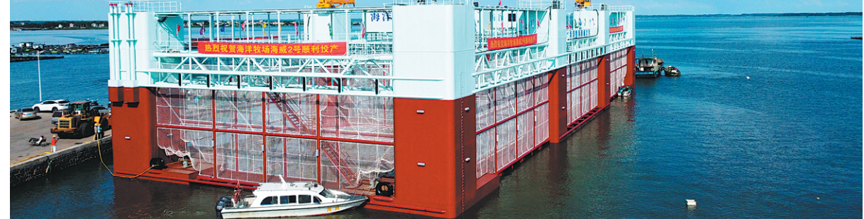
Haiwei No 2, a giant mariculture platform in South China's Guangdong province, comes into operation in Zhanjiang in June 2023.