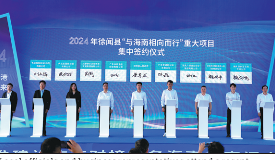
Local officials and business representatives attend a recent investment contract signing ceremony held in Zhanjiang,

As well, the city will cooperate with Hainan in areas such as industry, tourism, emergency response and more to further integrate with the Bay Area