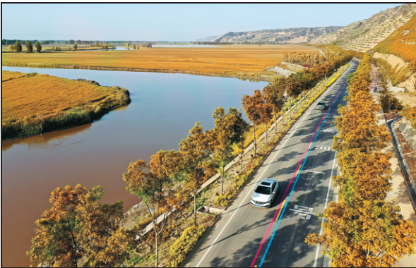
The Yellow River has become a landmark tourist attraction in Shanxi province.

Hequ in the northwest of Shanxi, is the first county in the province to integrate soil erosion into rural governance.