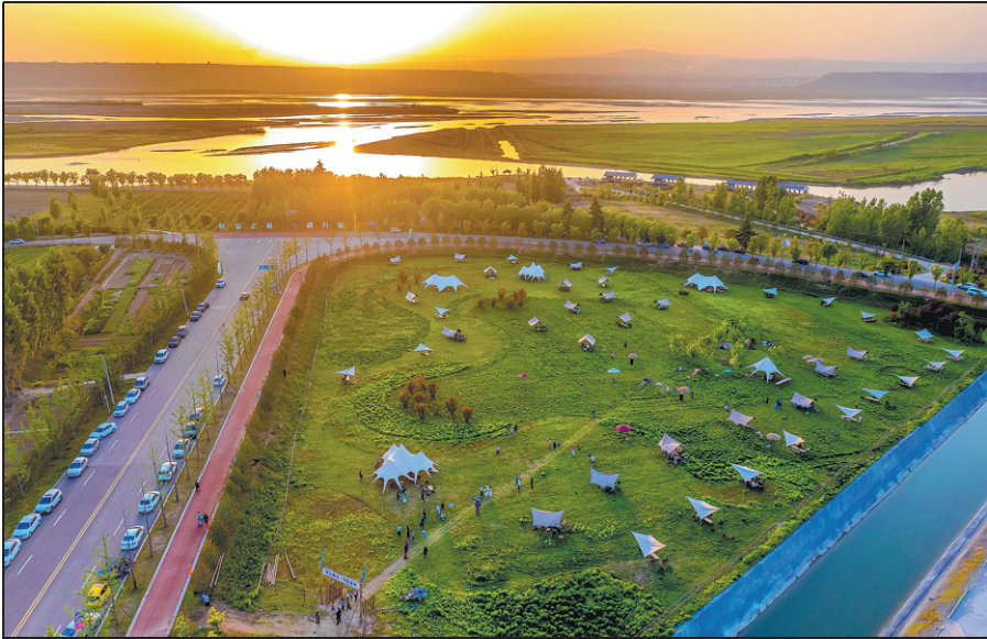
A wetland park at the confluence of the Yellow River and tributary Fenhe River.

Between 2018 and 2022, Shanxi saw a total of 2,300 square kilometers of land freed from soil erosion. By the end of 2022, about 56 percent of land suffering soil erosion had been effectively curbed, compared to the ratio of 53.8 percent in 2018. This marked an even sharper contrast with the 1950s, when 108,000 sq km of land, or nearly 70 percent of Shanxi's total area, was subject to soil erosion.