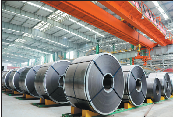
Steel products made by Jin Gang Holding are ready to be delivered. The company is on the 2023 China top 500 and Shanxi top 100 lists for private businesses.