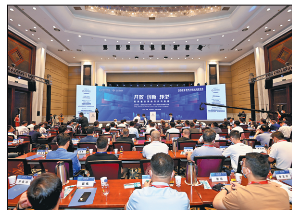
Shanxi hosts the Innovation Annual Meeting of the 2023 Yabuli China Entrepreneurs Forum in the provincial capital, Taiyuan, on June 17-18.