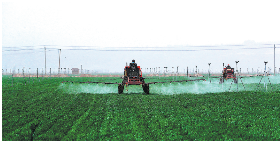
Tractors spray water and fertilizers on one of the wheat farms in the county of Ruicheng.

Machine-aided farming is now popular throughout rural Shanxi.