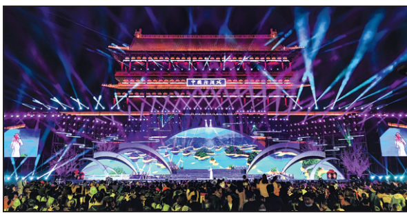
The township of Xinghua is an important hub for white liquor production and related cultural tourism in Shanxi province.