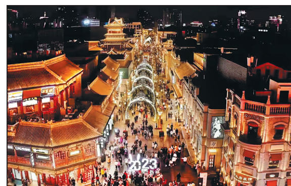
Bell Tower Street, one of the pedestrian streets in Taiyuan city, is crowded with visitors during the Spring Festival holiday.