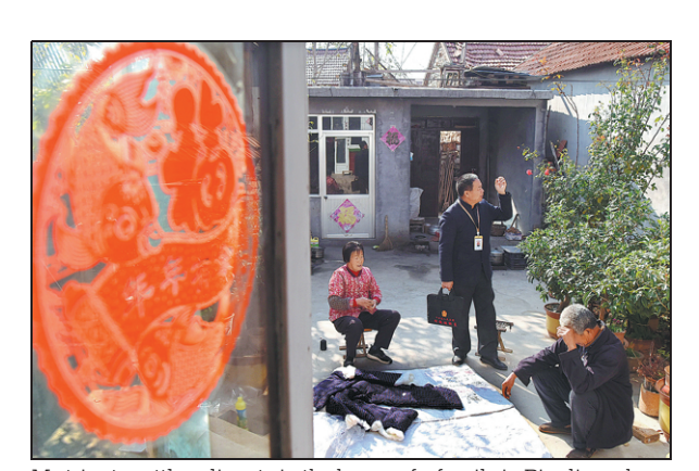
Ma tries to settle a dispute in the house of a family in Pianliangshan village on Nov 15.