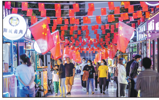
Residents visit a pedestrian street in the city of Yuncheng during the National Day festivities.

Period is an occasion for patriotic education, awakening people's love of the country