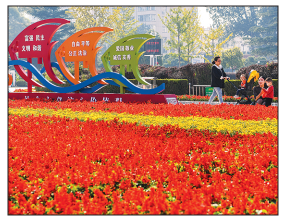
Residents visit a flower-decorated park in Changzhi city

"And now we know the term 'iron walls of Taihang' is not only a description of the landscape, but also a tribute to the heroes who protected the nation by fighting the Japanese invaders. When the nation and the people were at their most critical moment, the warriors of the army honored their pledge to 'build a new Great Wall with their very flesh