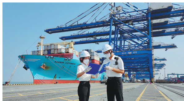
Clockwise from top: Nansha demonstrates its vast potential at Guangzhou Fair in August. Nansha vows to provide premium services to residents and businesses. Customs officers work at Nansha Port Area in Guangzhou.