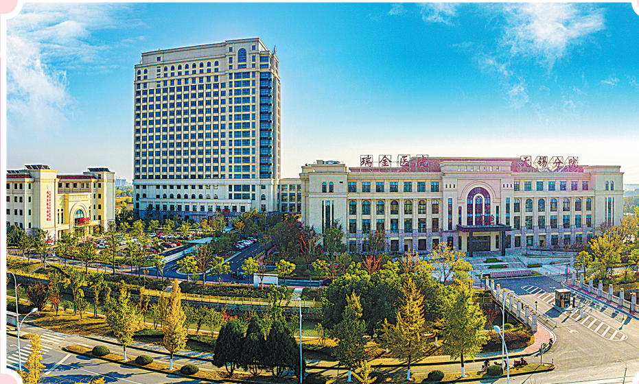
The Wuxi Branch of Shanghai-based Ruijin Hospital opens at Xinwu district in 2019, sharing prime medical resources from Shanghai with Wuxi and its surrounding areas.