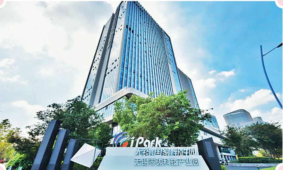
The Wuxi Zero-Carbon Technology Industrial Park, the first of its kind in Jiangsu province, is located in Xinwu.