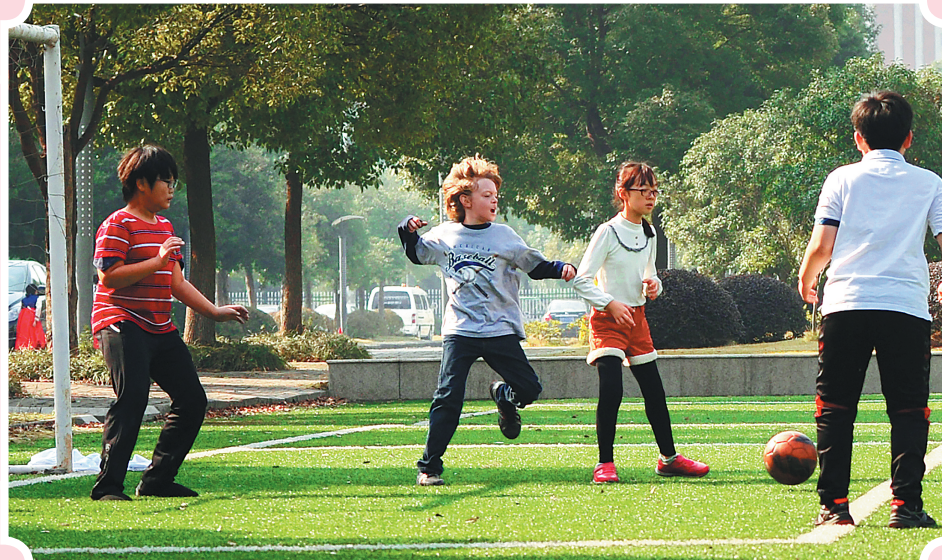
International school students play soccer after class in Xinwu district.