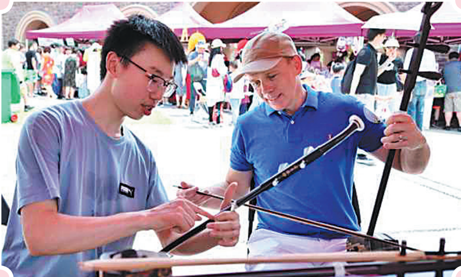
A foreign guest tries his hand at playing erhu, a traditional Chinese musical instrument, when participating in the International Day event at Boston International School in the district.