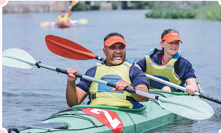
Foreign canoeists compete in a canoeing race on the Bodu River in Xinwu.

The district will also give full play to two major service industries — the high-end software and digital industries, and high-end commerce and air services — and the three future industries of artificial intelligence, hydrogen fuel cells and third-generation semiconductors.