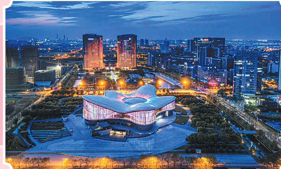
A night view of the district.