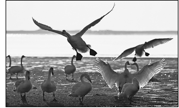
Whooper swans prepare for their migration to Siberia in Rongcheng on Wednesday.

"Environmental protection and income growth form a sustaina-